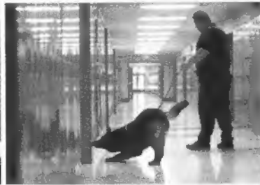
Seymour High school, Connecticut